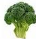
Broccoli 45% protein