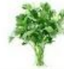
Parsley 34% protein