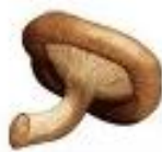
Mushrooms 38% protein