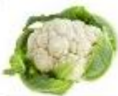
Cauliflower 40% protein